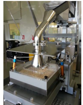
Developed Novel Capsule Thermoforming Process Technology and Configuration

A systematic design approach is devised and applied to develop a novel medication capsule feeding system. Critical design criteria identified and implemented include static generation reduction, uniform capsule dispersal, good conductive properties, ease of assembly, manufacture and cleaning, low maintenance and FDA approval. A series of designs are developed and Pugh's decision matrix approach utilised to determine optimal design configuration. Optimised 3D model design generation is achieved and novel prototype capsule feeder system fabricated and commissioned. Product quality assurance and regulatory compliance are central to the devised and undertaken validation testing. Prior to entry into commercial use, extensive validation processes and documentation including process failure mode effect analysis, microbiology testing, functionality report, material certificates, manufacturing certificates, working drawings, cleaning standard operating procedures and line clearance standard operating procedures are undertaken and prepared by the author.