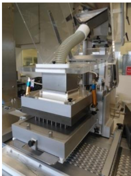
Original Capsule Thermoforming Process Technology and Configuration

Electrostatic analysis of capsule flow through the thermoforming process in a pharmaceutical environment is undertaken and the theoretical basis of electrostatic generation in an industrial setting formulated by the author. Validation is achieved through the development and implementation of standardised electrostatic measurement procedures, leading to identification and quantification of major areas of electrostatic generation in the thermoforming process. Medication capsule movement is mapped out using a devised process map - static measurement points taken in each area. Temperature and humidity readings are taken and recorded to determine effect on static generated. 56 sets of static data are gathered over a three month period covering different batch sizes, different capsule sizes and product combinations. Varying environmental and storage conditions of the capsules are also taken into consideration.