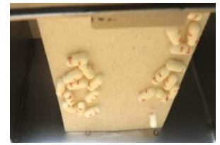
Capusle Flow Disruption

Significant product waste and downtime during an industrial thermoforming process - designed to place the medication capsules into a continuous web of blister sheets - are observed and analysed by the author. Static electricity generation is believed to be the root cause of the downtime and waste issues. Static analysis determines that the thermoformer is running at an all time low of 89.5% efficiency. Static related downtime is initially estimated at circa 2.2% or 4,700 minutes - equating to an estimated loss of 40,000 medication capsule packs per year.